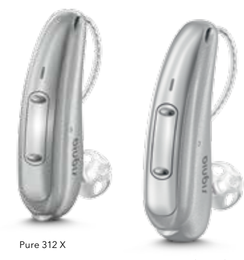
Pure 312 X with T-coil

The all new hearing aid platform and the new smaller Pure 312 X delivers powerful performance for an outstandingly personal hearing experience. All day long.