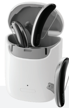
Styletto Portable Charger