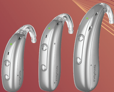
Motion Charge&Go M IX